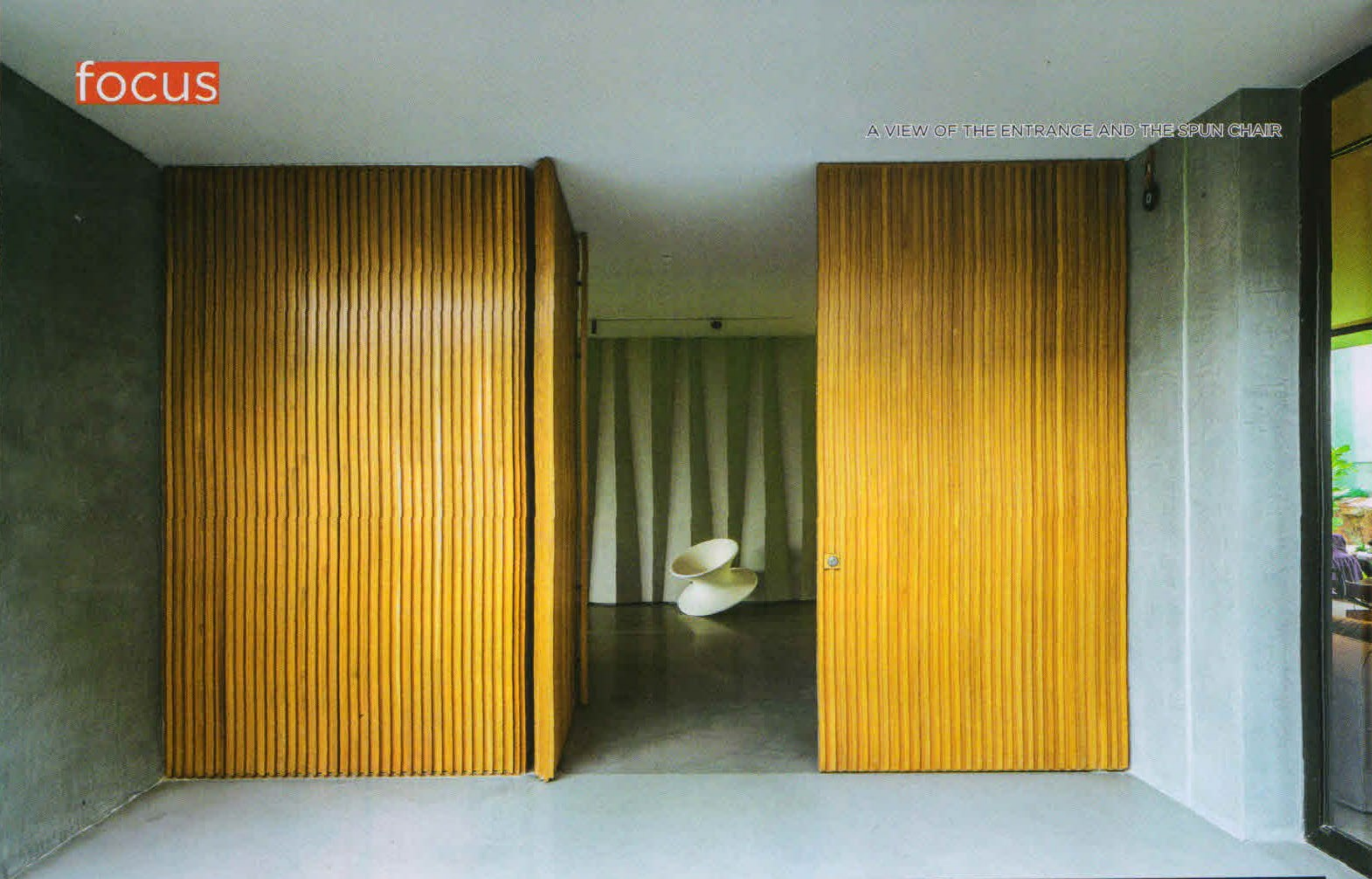
A VIEW OF THE ENTRANCE AND THE SPUN CHAIR