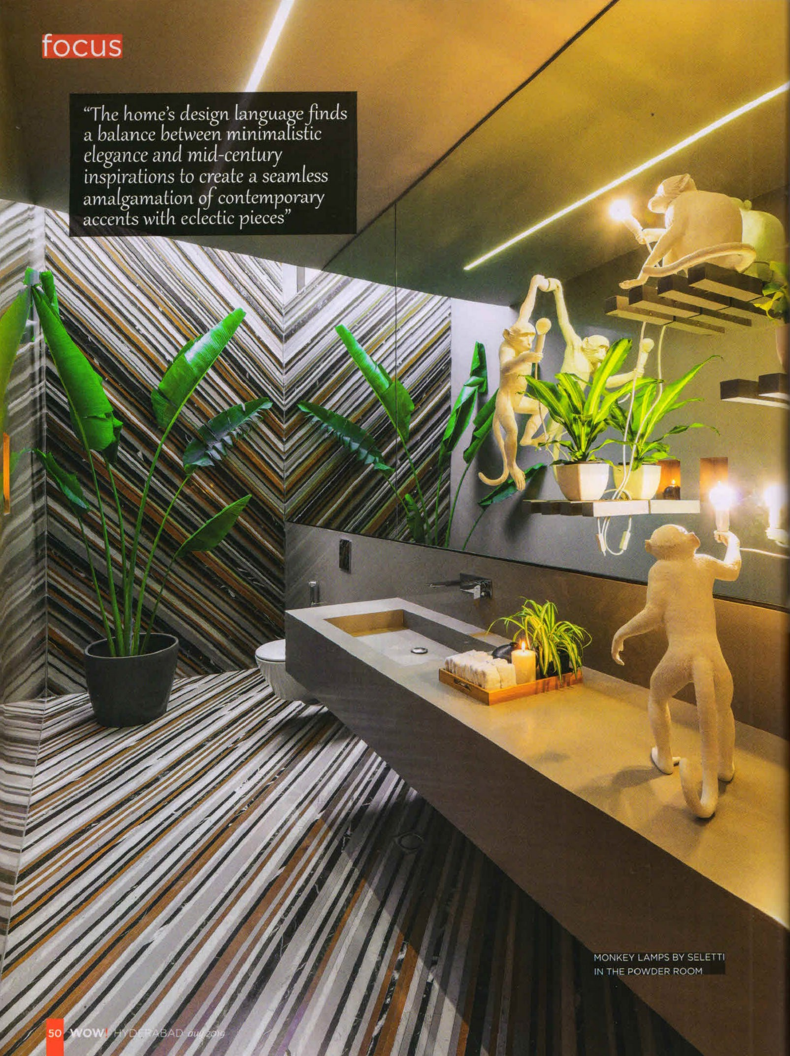
MONKEY LAMPS BY SELETTI IN THE POWDER ROOM

“The home’s design language finds a balance between minimalistic elegance and mid-century inspirations to create a seamless amalgamation of contemporary accents with eclectic pieces”