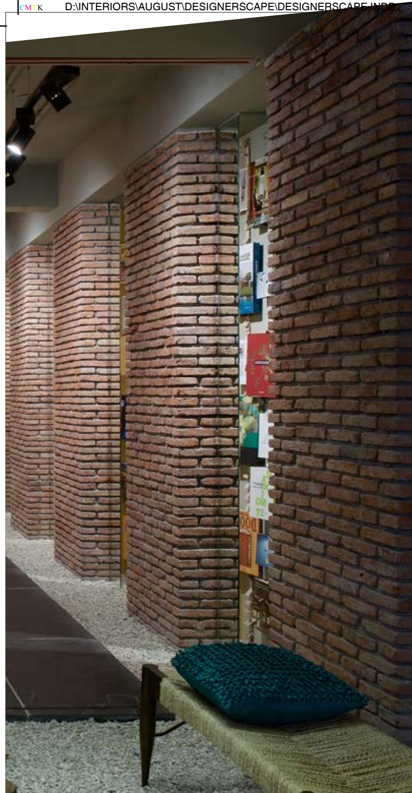
2 A view of the modern work space from the rustic chill out zone.